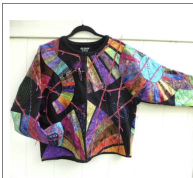
Island Batik Jacket

The following day, Tuesday, Jan 17, she will host a Batik Jacket Workshop at White Bluffs from 10-3. Signups will be at the January meetings, or download the registration form from our website. Cost will be $50. Students will bring a sweat-shirt to be transformed into a jacket. The workshop kit includes the jacket pattern and 22 wedges of 22" long batiks which will do most of the jacket. Students should bring batiks they might want to also put in the jacket. They may or may not use them but at least will have them available. Connie will have skeins of glitzy yarns and/or piping that may be used. Ribbons can also be used to accentuate the jacket.