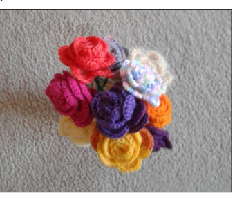
Roses are crocheted.