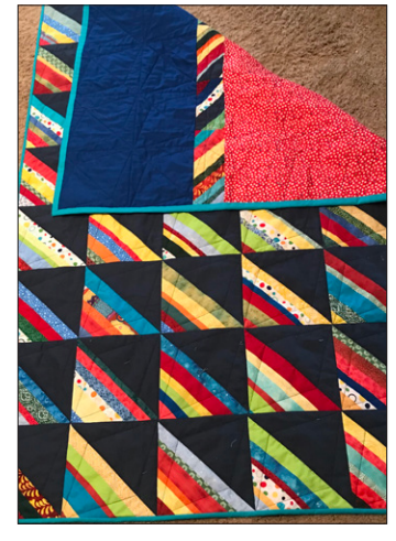
Scrap quilt made for Habitat during the quarantine.