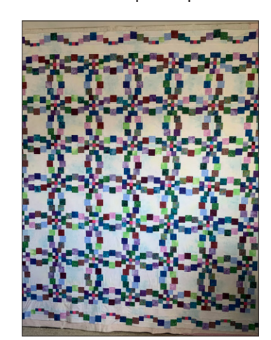
Monet Wedding ring quilt.