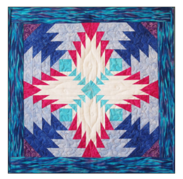
White Bluffs Pineapple Log Cabin 18"x18" was made for WB's Log Cabin Challenge last fall. It was quite difficult to locate an image of a curved pineapple log cabin, but I found ONE, enough to work out the math needed.