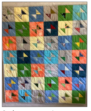
Can't go wrong using scraps to make this bow tie baby quilt if a boy will be the surprise.