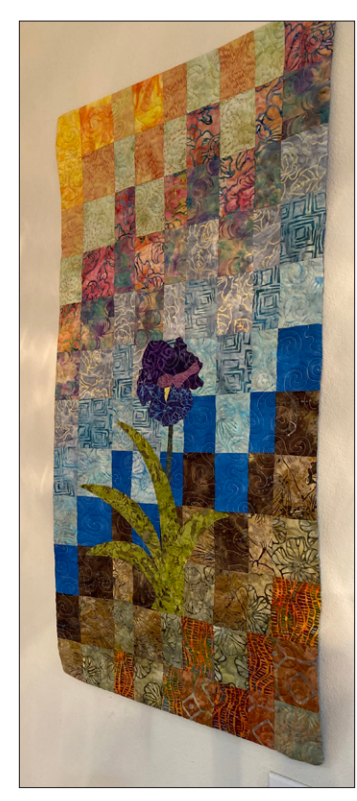
Another "River Runs Through It" challenge quilt.