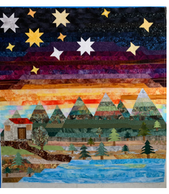
Landscape quilt in progress.