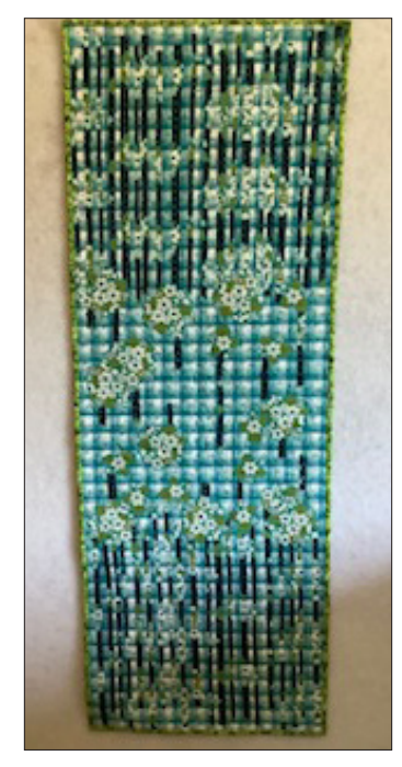
An Illusionary table runner made with plaid I purchased last year in Germany.