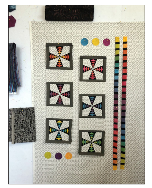
Matching up the background, which has not only a directional design horizontally but also vertically, took hours and lots of pinning and more pinning.

works, and other times not so much. I had a fat quarter of the background I wanted to use and realized two important things. One, it was a directional print and two I didn't have enough to do what I needed. No worries, I'll just order more from the quilt shop where I bought it last February in McKinney, Texas while visiting my son. It's only been three months; we are in the middle of a pandemic and the shop is closed. Amazingly, they got my order, had