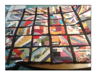
A crumb quilt.