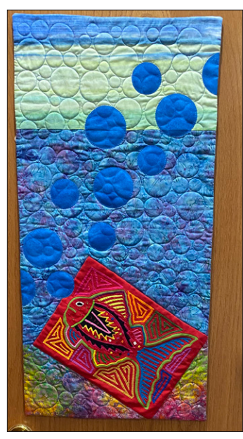
"A River Runs Through It" challenge for the Sew What Friendship Group.