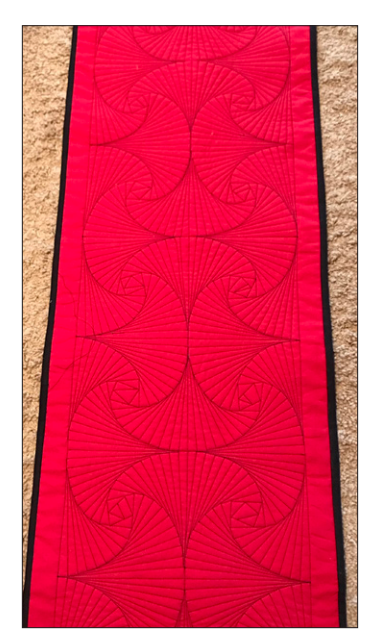
"Conundrum" Table Runner