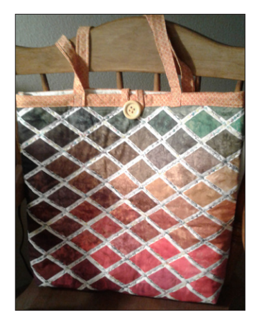
Bag is from Hoffman watercolor sampler