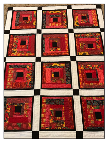
Another quarantine quilt

This top was made from one of the guild kits consisting of an assortment of coordinating fabrics without a pattern.