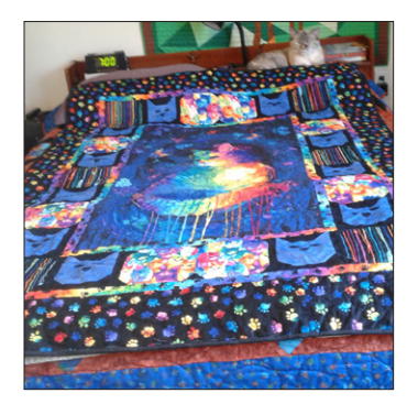
Quilt kit called "Cat's Meow."