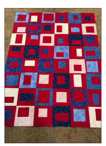
This is an example of a quilt from a bunch of kits several of us made up to hand out at the Tailgate. I pulled the fabric for this one from the Guild Closet on July 3 —- so I had 4th of July colors on my mind.