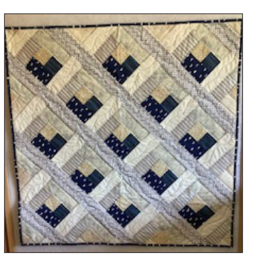
This quilt will be sent soon for the unveiling of my nephew and his wife's virtual St. Louis baby shower. I used stash for this Heart Log Cabin, a free pattern from Sew Can She.