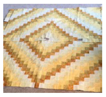
More of Barbara's quilts continued are on the next page.