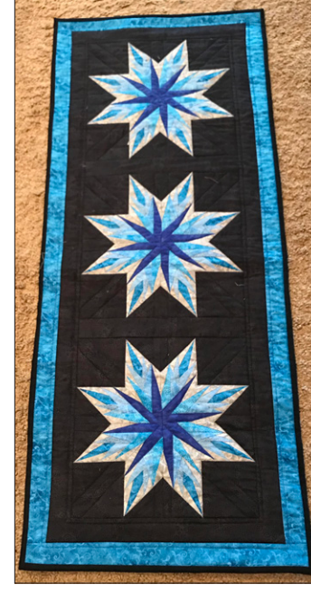
"Winter Star table runner that would have been in the show.