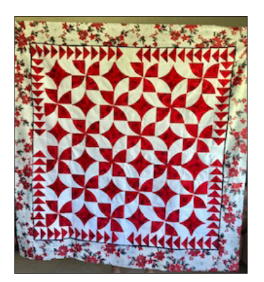
This is a Jenny Pedigio special ruler. The red is roses from timeless treasures. [The next three have no information.]