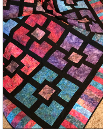
A "Hole in the Wall" quilt. I made one, so did four friends (in different colors).