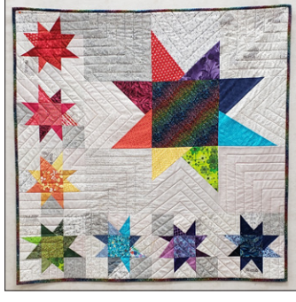
I just finished for one of my husband's coworkers who has a baby due in Sept. It wasn't slated for the Stars exhibit, but I think it would have made a nice addition! We can caption it "Wonky stars scrappy quilt destined for an Indianapolis baby due in the fall." saw a picture on Pinterest and just made it up as I went along!