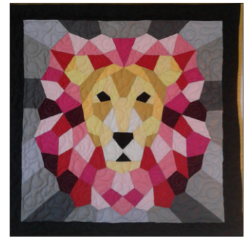
Lion wall hanging is paper-pieced.