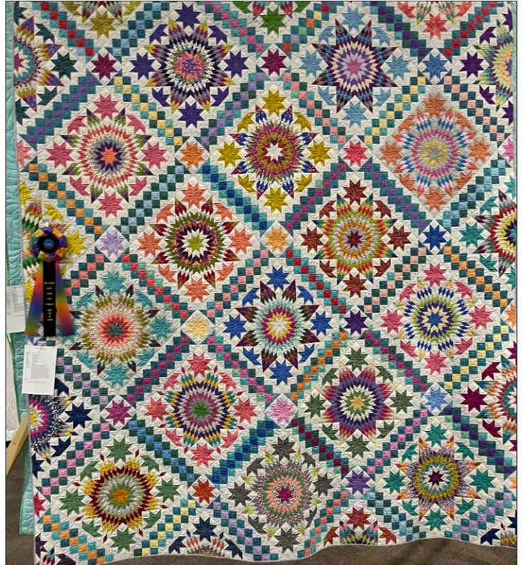
BEST USE OF COLOR 2022 Alice Ikenberry "Oh My Stars"

This quilt is my modern version of an antique quilt called "Stars Upon Stars." It brought me such joy in a time when everything was upside down. It's made with the English paper piecing method, which is hand stitched. I used only my fabric stash for all the blocks and purchased the sashing fabrics. The only real specific color placements were made for overall balance as the quilt progressed. It took about 5-6 months to complete it. Part of that time was remaking half the sash units. I didn't like my first choice as I saw all the blocks together. That was painful. There are 8,600 total pieces.