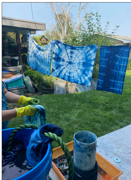
Create your own vibrant fabric in Jo's dye classes. Below, a recent indigo dyeing class at Jo's dyePot studio (aka backyard)