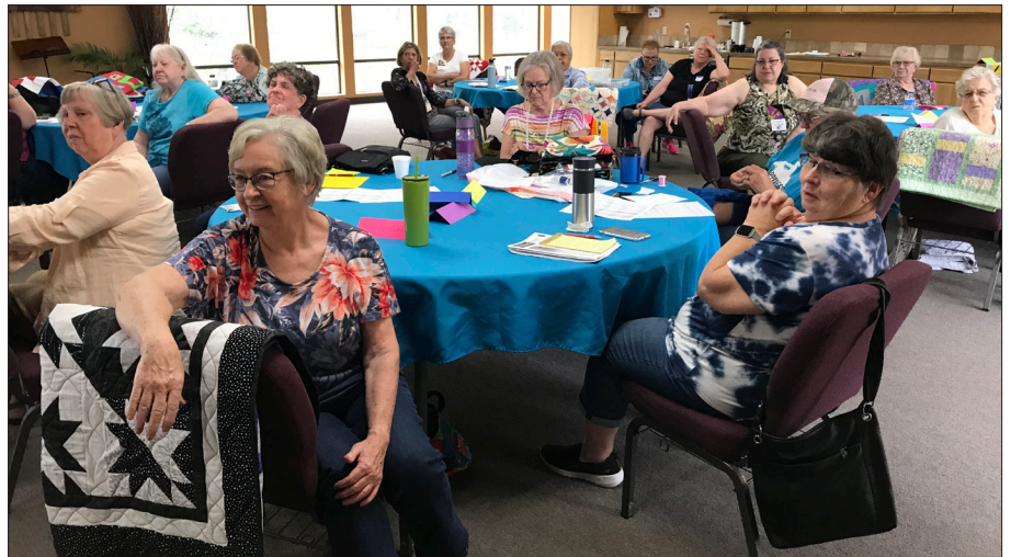
WELCOME BACK — After 16 months of worry and wondering, we rang in the new post-covid "Now Times" with our first in-person, inside meeting in July at Hillspring Church!