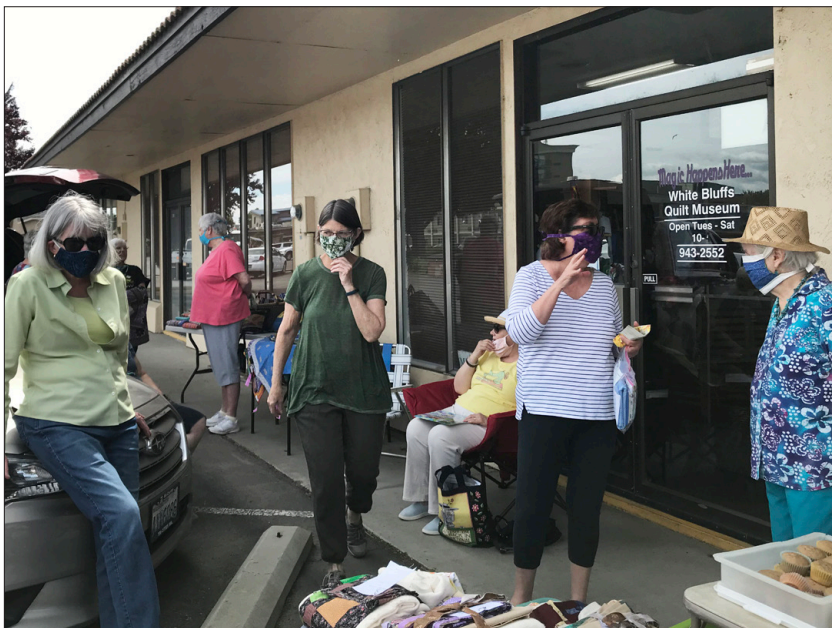
It was good to see at least some of our faces (literally & figuratively) at the recent tailgate at White Bluffs. Don't miss "Tailgate.2" July 25, 10-2 again at White Bluffs.

Take part in the next Cooped-Up Quarantine Show & Tell Gallery! Email your photo and story caption to oc.carol@gmail.com by July 20.