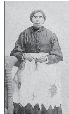
Harriet Powers 1839-1910