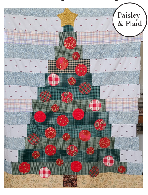
Above and below are the same quilt—check out the quilting with lights!