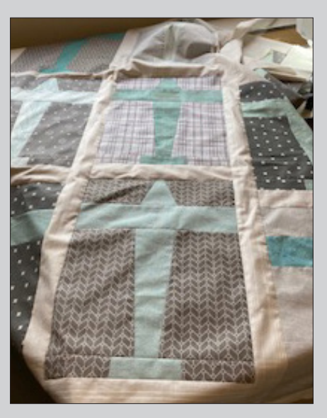
▲ Vintage airplane quilt for Air Force son for Christmas.