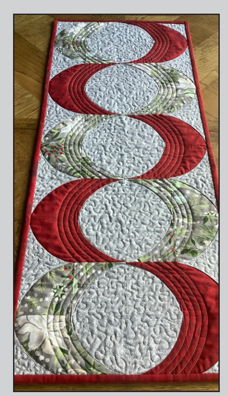
▲ Christmas gift using Mini Quick Curve Ruler for this table runner.